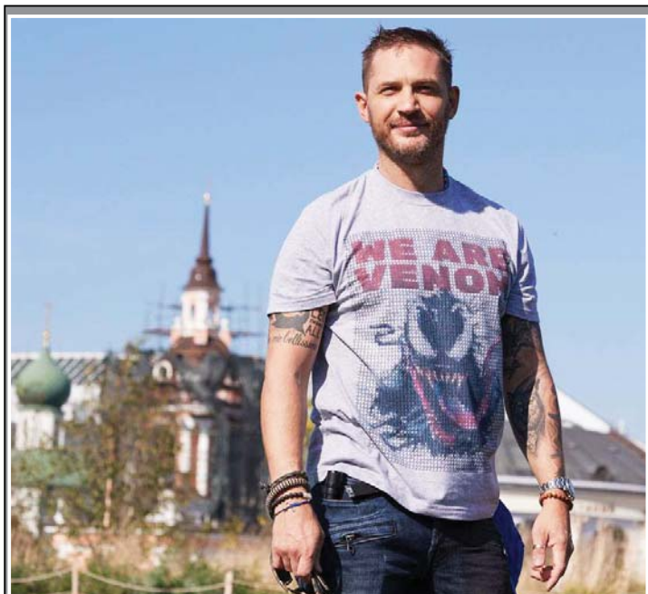
MARVEL SUPER FAN! Tom Hardy attends the photo call for his upcoming film, Venom, in Moscow, Russia.

Hindi film "Newton" by director Amit Masurkar and starring Rajkumar Rao was India's official submission to the Oscars last year.