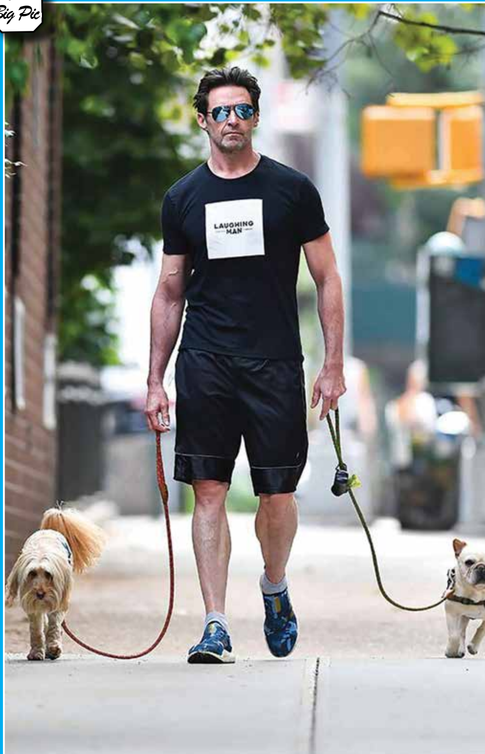
DOG DAYS! The actor, Hugh Jackman is spotted taking a walk with his two adorable pups on the streets of NYC.