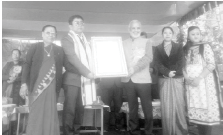
Yogen Thatal Singtam, 13 Dec:

"That there are about 250 cases pending in different high courts in which further proceedings in criminal cases against MPs/MLAs have been stayed. High Courts may be requested to decide all such cases preferably within three months from date of order of the court," the report said.