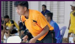
SIKKIM BOY TO PLAY IN 2ND INDIAN OPEN PICKLEBALL TOURNAMENT pg03