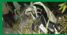
DRIVER INJURED IN ACCIDENT AT MP GOLAI pg03