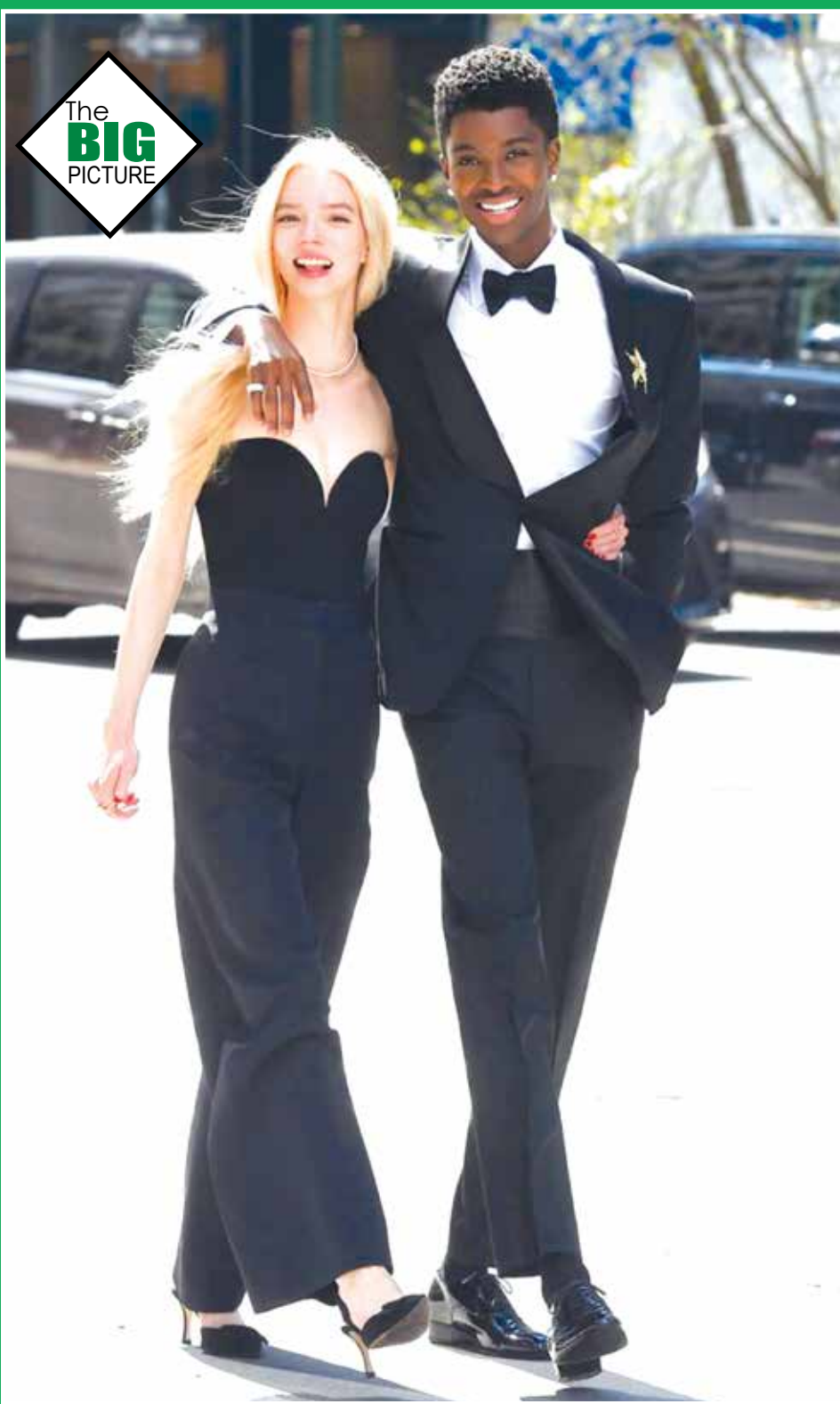
BEAUTIFUL PEOPLE! The Queen's Gambit actress, Anya Taylor-Joy and model Alton Mason are all smiles during a photoshoot for Tiffany & Co in NYC.