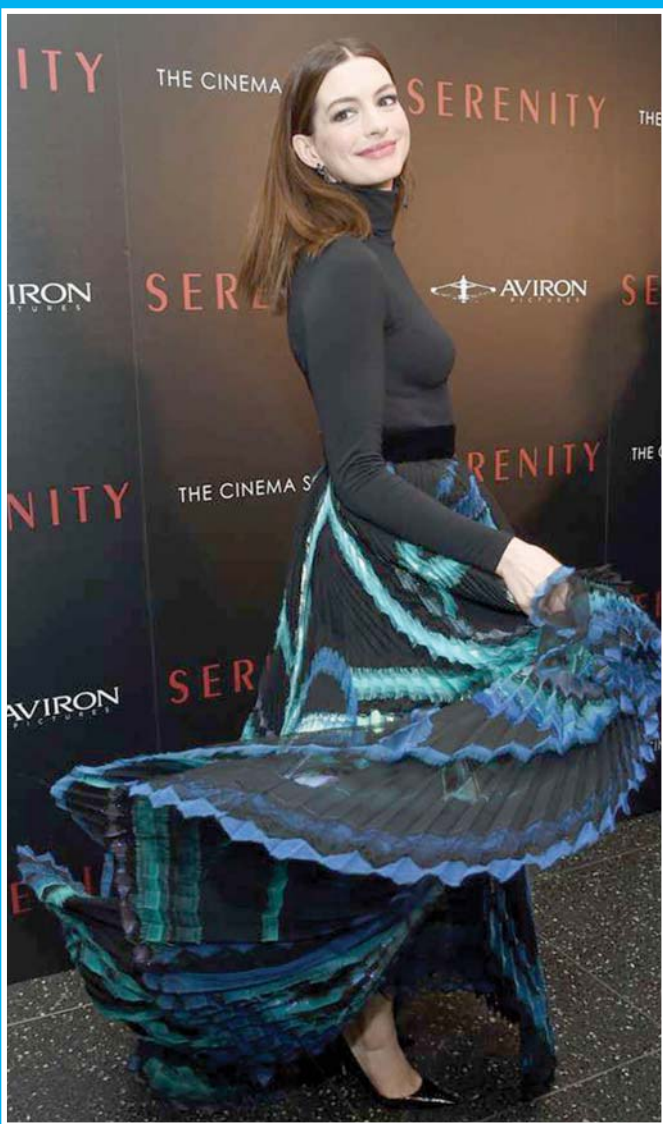
TWIRLS! Actress Anne Hathaway spins in a gorgeous blue printed skirt at a screening of Serenity in NYC.