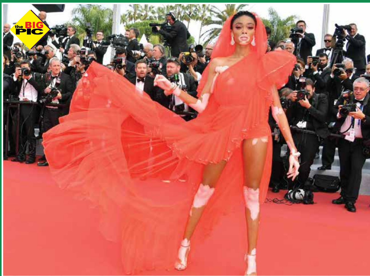
DRAMA! The Victoria's Secret model, Winnie Harlow rocks a showstopping red gown at the screening of Once Upon a Time in Hollywood during the Cannes Film Festival.