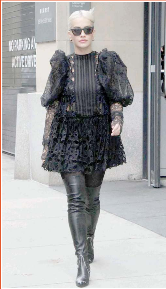
STREET STRUT! Singer/actress Rita Ora was seen strutting down in NYC looking fashionable in an all black ensemble.