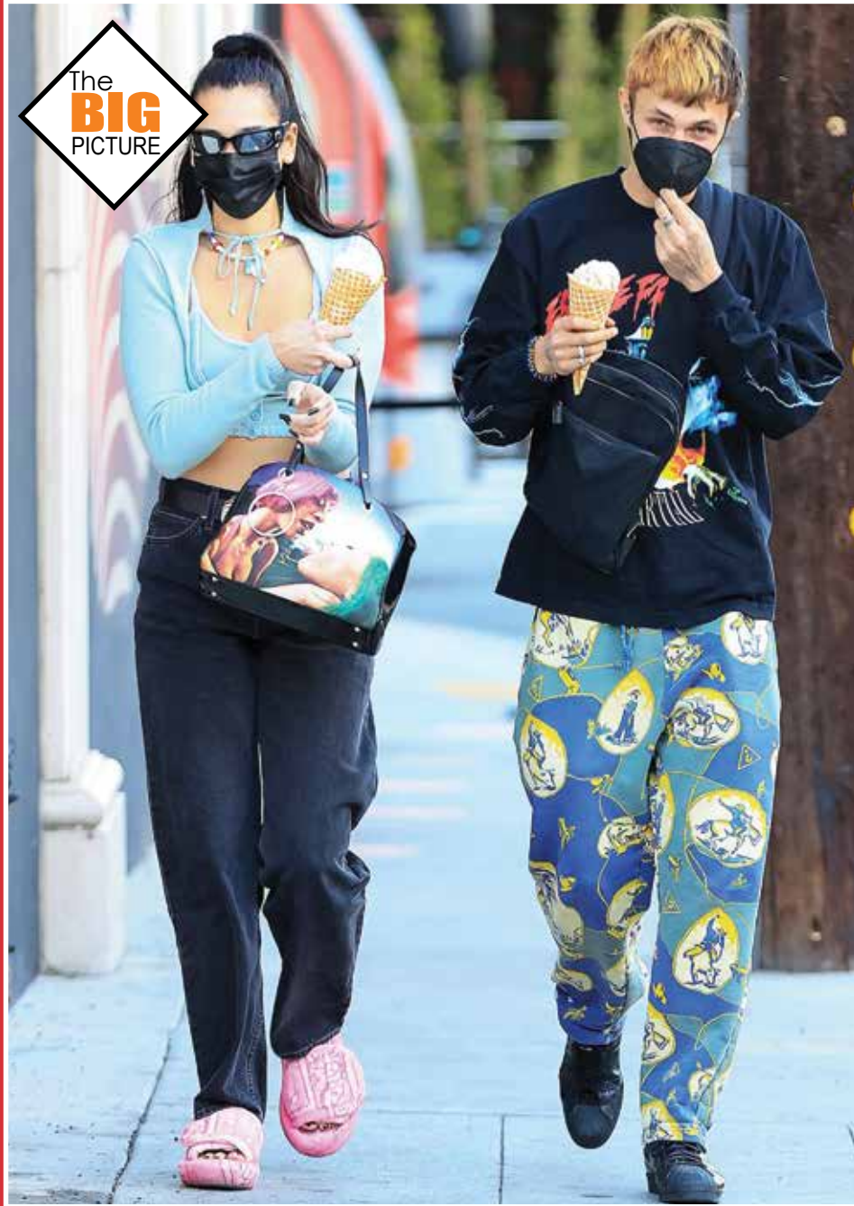
ICE CREAM OUTING! Couple Dua Lipa and Anwar Hadid enjoyed ice cream in West Hollywood.

Hammer was also dropped by his agency, WME.