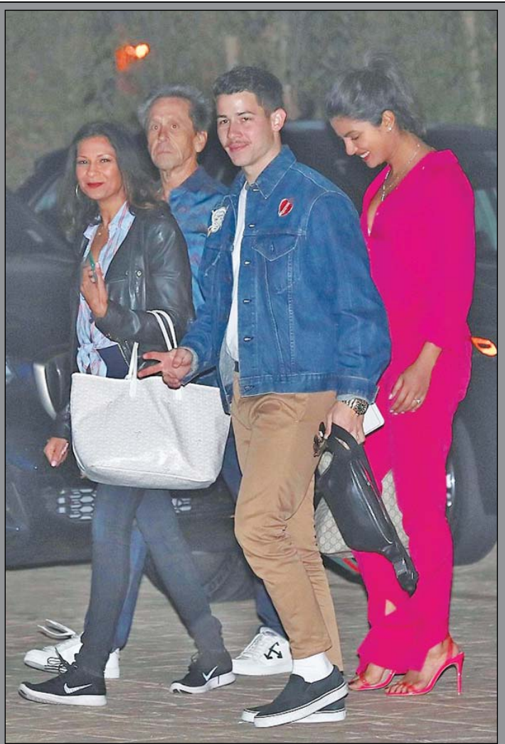
SMITTEN! Priyanka Chopra, 36, beams in a bright fuchsia ensemble as she enjoys date night with fiancé Nick Jonas, 25, at Nobu in Malibu.