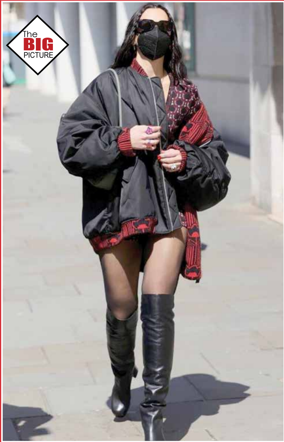
OUT AND ABOUT! The singer, Dua Lipa looks fashionable as she rocks thigh-high boots in London.