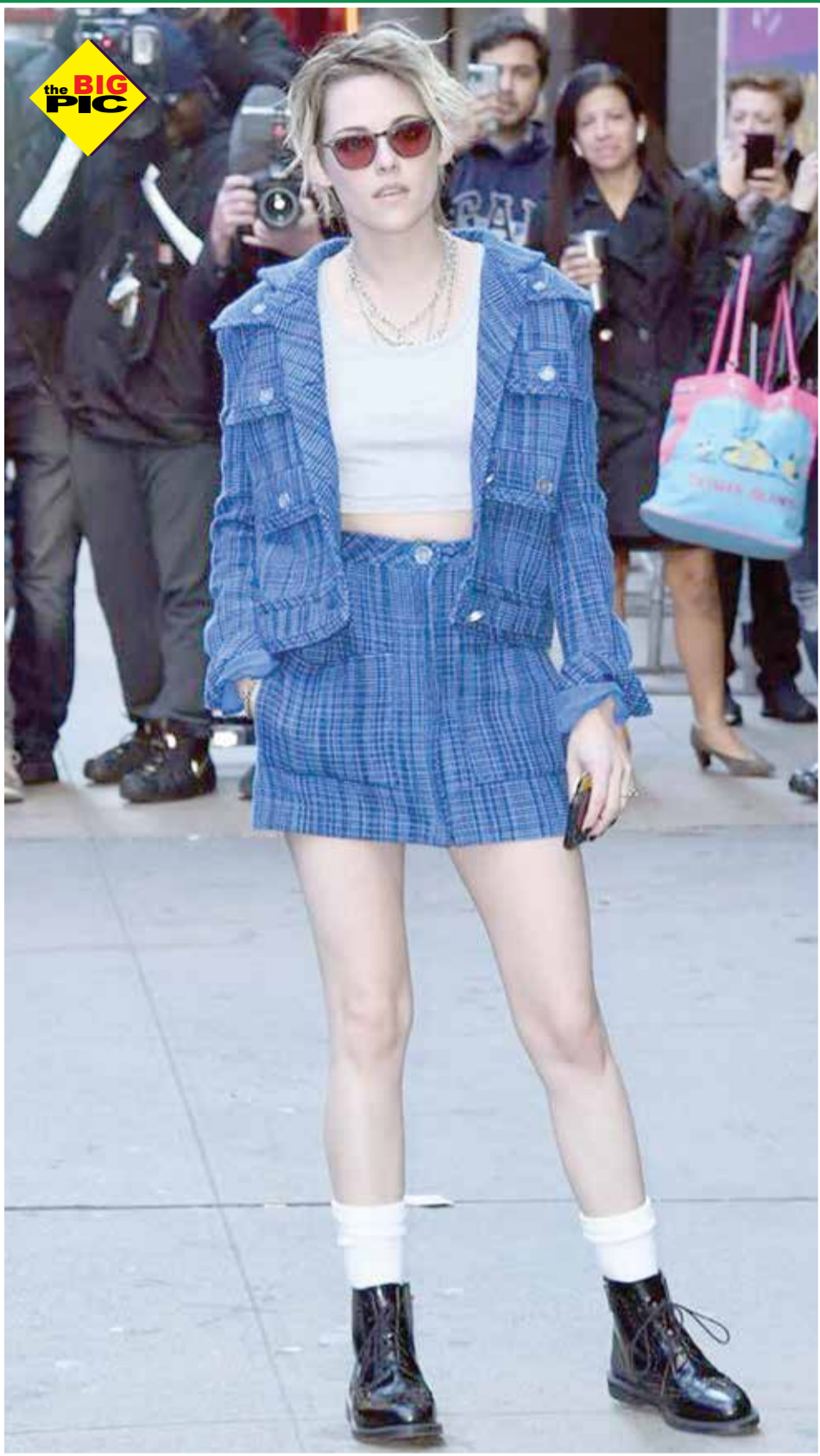
SWEET LOOKS! The Charlie's Angels star, Kristen Stewart pairs a blue jacket and skirt combo paired with black lace up boots while leaving the Good Morning America studio in New York City.