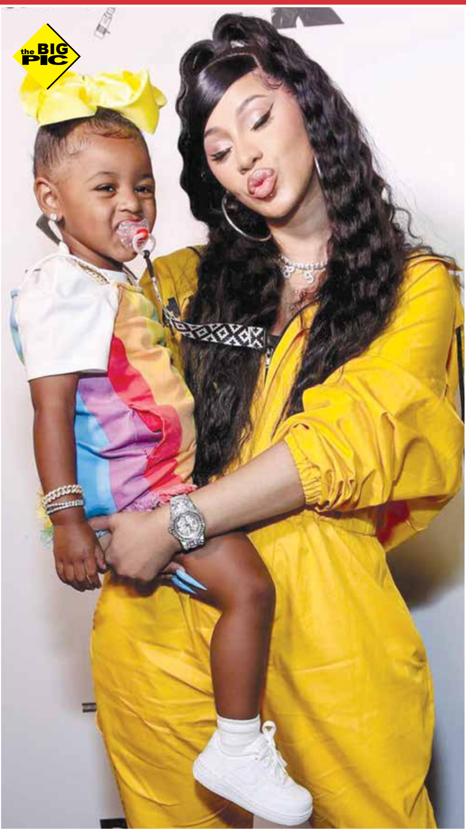
MAMA-DAUGHTER PHOTO! The cute pair, Kulture Kiari Cephuss & Cardi B poses together during Teyana Taylor's listening party in Beverly Hills.

The development comes as media companies reap-praise content in the wake of protests over police brutality and systemic racism after the death of Floyd, an African American man killed by Minnesota Police last month.