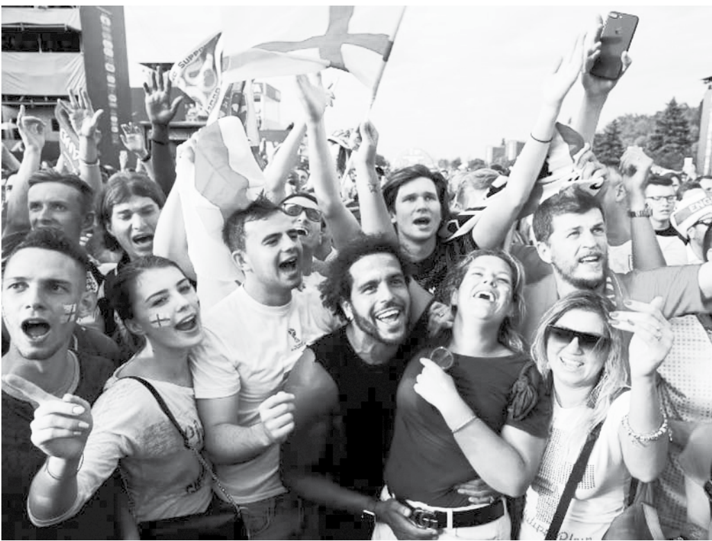
BEERS AND CHEERS AS ENGLAND FANS GO WILD OVER WIN: Fans back home erupted in celebration and the beer went flying as England reached the World Cup semi-finals for the first time in 28 years on Saturday. At Flat Iron Square in London, where 650 people crammed in to watch on a giant screen, the party began with beer showers and chants of "Football's coming home" after the 2-0 win over Sweden in Russia. Friends leapt on one another's shoulders to belt out the song from the 1996 European Championships, an uplifting Britpop anthem of maintaining hope against precedent.

On Friday, rebels and the regime announced a ceasefire deal, providing for opposition fighters to hand over their heavy weapons and paving the way for a regime takeover of the province.