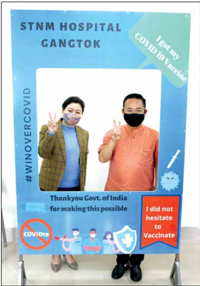
The Tika Utsav was announced by the Prime Minister as a move to ramp up Covid vaccination. In the same manner, the CM

In his brief address to media, the Chief Minister appealed to the above 45-year-olds to come forward and participate in the Tika Utsav by getting themselves vaccinated.