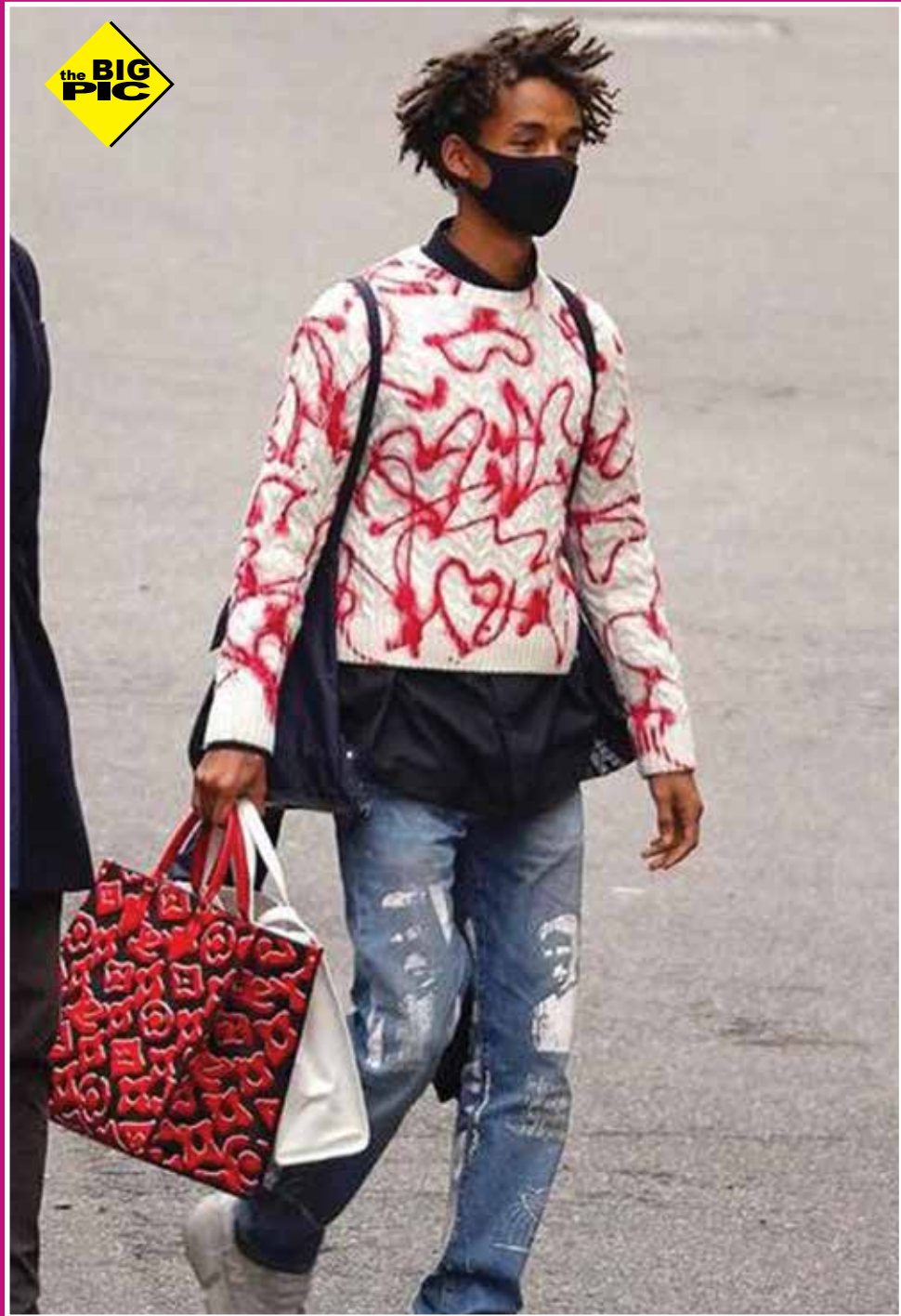
FASHION FANATIC! Jaden Smith, the young actor and singer looks stylish as he hits the shops in Milan, Italy.