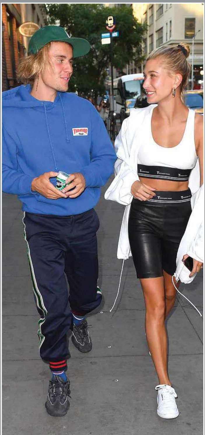
JUSTIN BIEBER & HAILEY BALDWIN: Total eclipse of the heart! The newly engaged couple goes to eat dinner at Cecconi's in Brooklyn, New York, while Bieber pops a piece of Eclipse gum in his mouth.