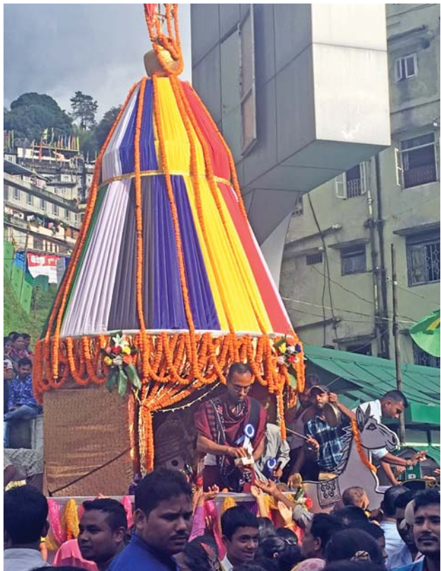
JAGANNATH RATH YATRA IN GANGTOK

Jagannath Rath Yatra was today celebrated in the capital with devotion and traditional fervour. The festival holds high significance among the Hindus particularly the Vaishnava sect. A chariot procession is held with the idols of brothers and sister Lord Jagannath (Krishna), Lord Balabhadra (Balaram) and Goddess Subhadra.