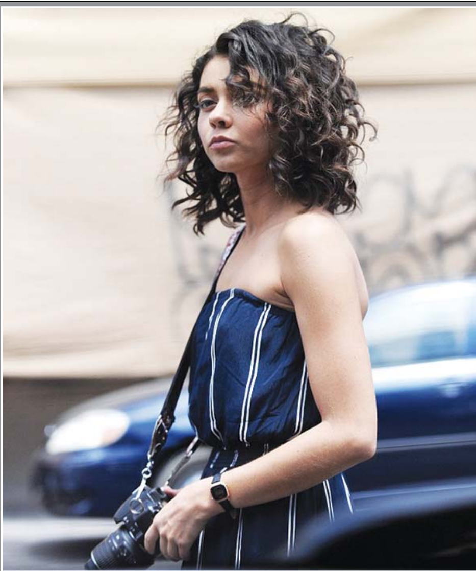
END OF THE ROAD! Modern Family star Sarah Hyland was spotted filming final scenes for her upcoming movie, The Wedding Year , in Downtown LA.