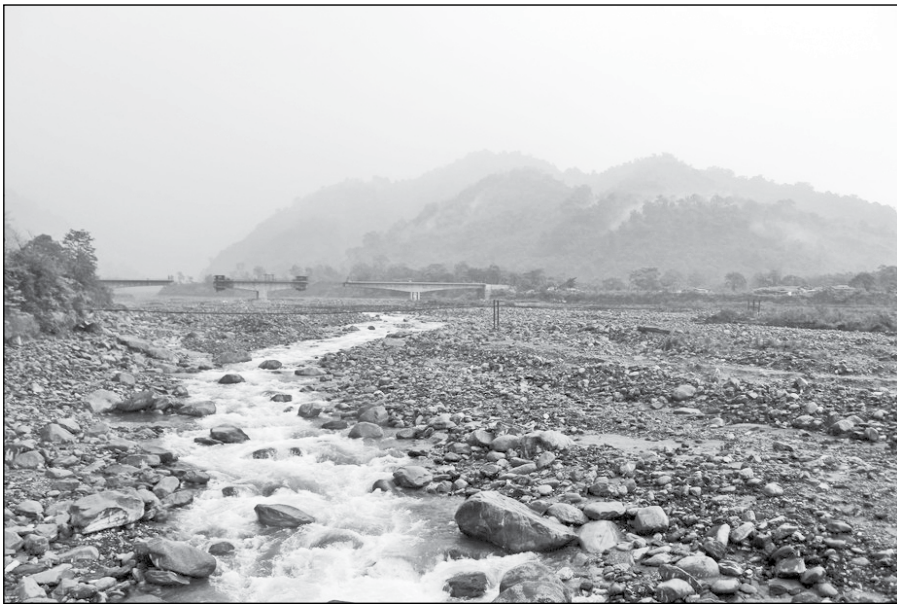
The Eze or Deopani river, near Roing.

Several infrastructure projects undertaken by New Delhi in this state have picked up pace in the past decade, more so after the current BJP government came to power in 2014