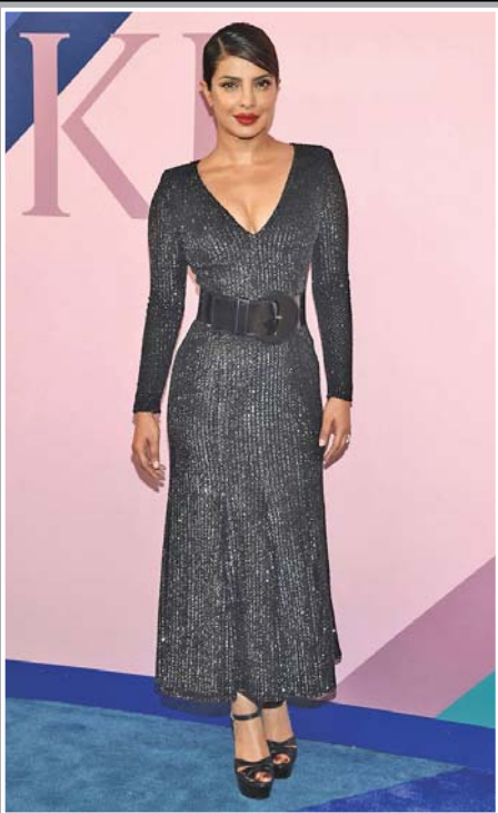
PRIYANKA CHOPRA: "Dear NYC, are you ready for this tonight?" the actress shared on Instagram while posing with dress designer Michael Kors.

Piers Morgan apologized for criticizing Ariana Grande. Morgan had slammed the singer for returning to the United States instead of staying in Manchester to visit the victims and their families after the attack at her May 22 concert. The outspoken journalist, 52, changed his mind about the 23-year-old popstar after watching the One Love Manchester benefit concert on Sunday, June 4, that Grande put on to raise money for the families of the 22 people killed and dozens wounded. "I thought Ariana Grande was wrong to fly off after #ManchesterAttack but tonight she's putting on a fabulous show #OneLoveManchester," Morgan tweeted on Sunday. "I misjudged you, @ArianaGrande & I apologise. You're an admirable young woman & this is a magnificent night. Respect." He added in another tweet on Monday, June 5,