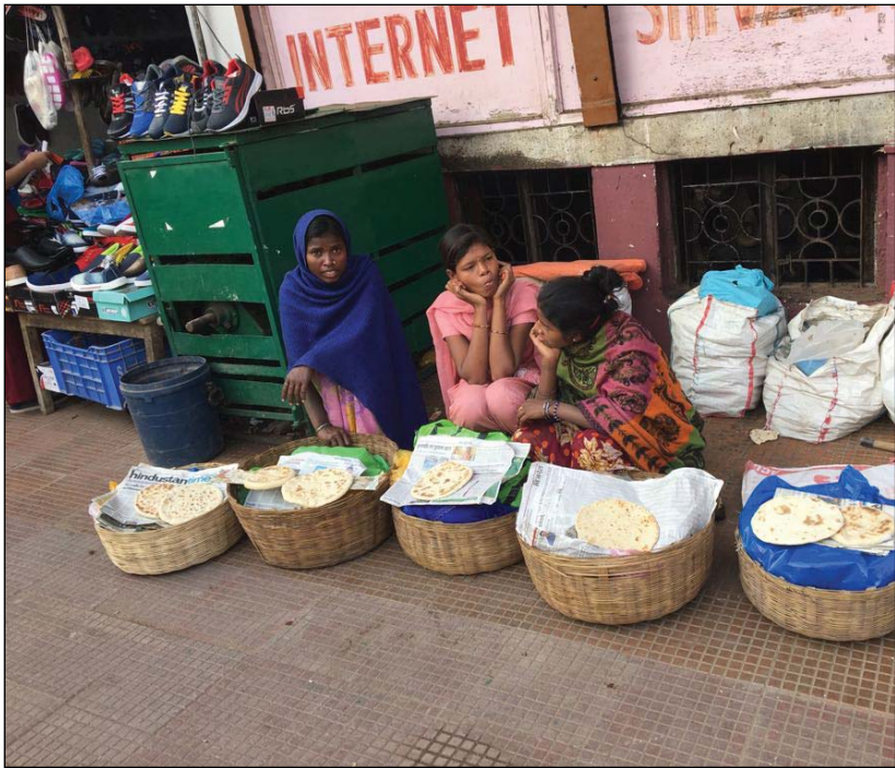
PHALEYS IN THE LAND OF THEKUWAS! The huge number of Tibetan visitors every year in Bodhgaya has not only meant exchange of spiritual teachings, but some culinary ones as well. At this time of the year, there are numerous stalls selling 'paleys' outside the Mahabodhi Temple. Bihar kids can now mouth some Tibetan as well as they try to convince visitors to buy some phaleys.