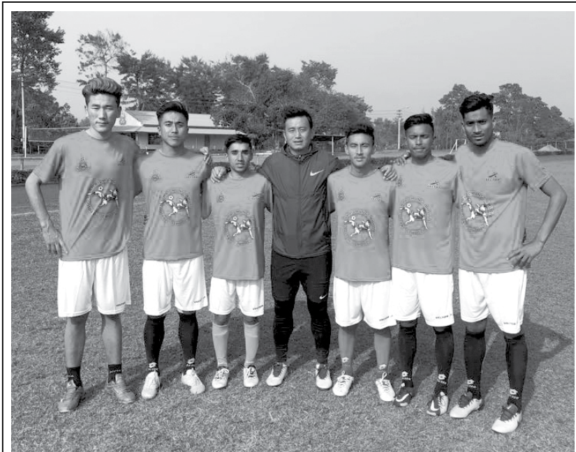
SILIGURI, 20 JAN: Bhaichung Bhutia with U-21 players of Sikkim squad for the upcoming 72nd National Football Championship for Santosh Trophy at Siliguri today.