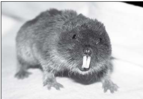
Mole voles have no Y chromosomes

Looking to other species (Y chromosomes exist in mammals and some other species), a growing body of evidence indicates that Y-chromosome gene amplification is a general principle across the