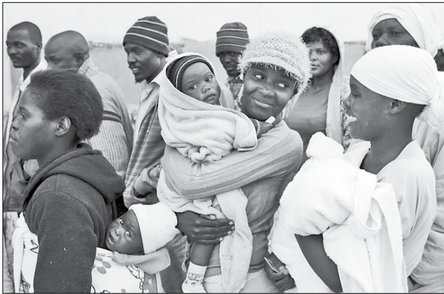
People across Africa don't have access to mental health professionals. A new community-based approach in Zimbabwe is proving effective.