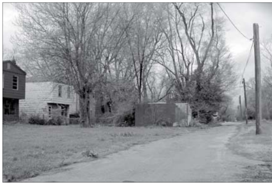
Parts of the world are grappling with the urbanisation problem but some other parts experience the opposite: their city is shrinking.

Throughout history, as population increased and urbanisation took place, all types of infrastructure for water, energy and transportation had to be built to meet the steadily expanding needs. All societies have had centuries of experience on how to expand infrastructural requirements. Considerable expertise and technology were developed to meet these advancing needs.