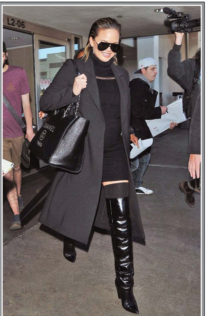
BACK IN BLACK! Pregnant Chrissy Teigen is supermodel chic as she rocks thigh-high leather boots and a $3.5k Chanel shopping bag. She's expecting her second child with husband John Legend in June.

The film is slated to air on HBO later this year.