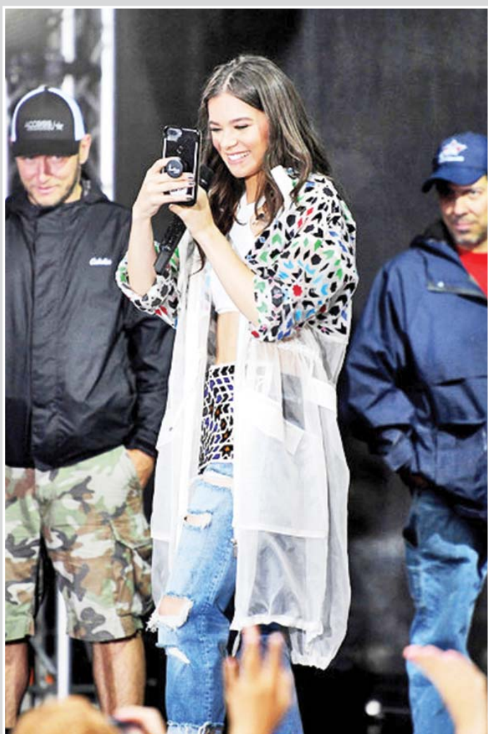
TIMEOUT WITH THE FANS! The "Love Myself" singer, Hailee Steinfeld, takes a cell phone image of her fans as she performs on NBC's "Today" at Rockefeller Plaza in New York City.

1905: Owing to the decision of the British Government for the Partition of Bengal, a decision was taken by the people to boycott British goods at Bagarhat. 1929: Indian Council of Agricultural Research, an autonomous apex national organisation which plans, conducts and promotes research, education, training and transfer of technology for advancement of agriculture and allied sciences, was established. 1954: French rule ends in Mahe. De facto power was transferred to the people and the Indian flag hoisted.