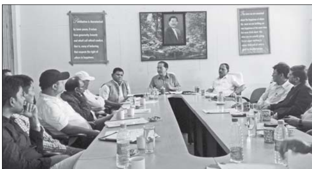
talked about the 'Khelo India' programme of the Center which aids the upliftment of sports in the State. Various agendas

Highlighting the main issues regarding sports sector in the state, he