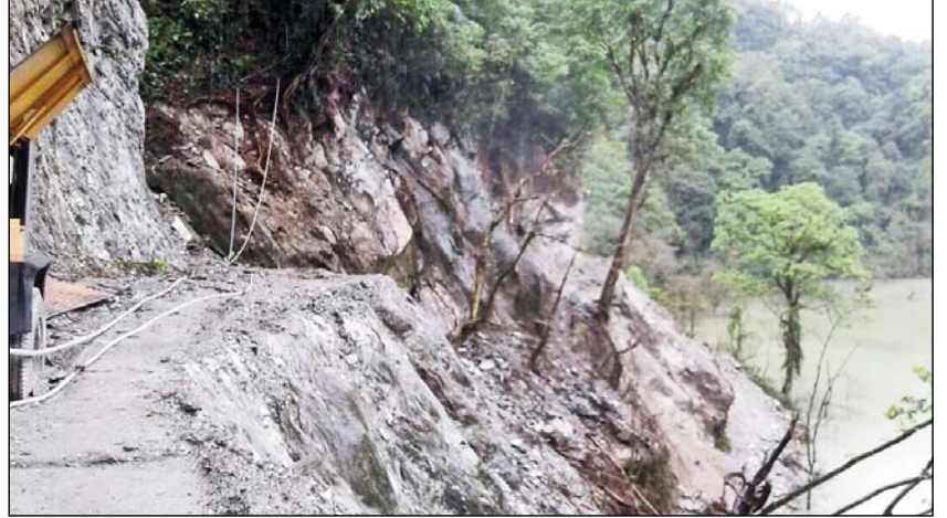
With a new alignment (above) finally cut out for a new road to villages beyond the Mantam lake in Upper Dzongu, Juguangs like rafting a truck across to the other side (left) might not have to be risked any more.