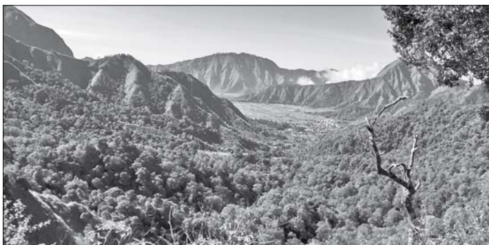
Contested claims in Lombok, Indonesia lead to forest encroachment and degradation

[the writer is PhD Candidate and Demonstrator in the Development Practice Programme, James Cook University]