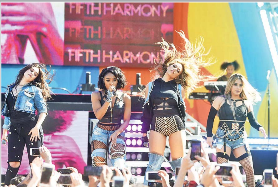
DOWN AS A QUARTET! Fifth Harmony performed an upbeat new tune on Good Morning America on 02 June premiering their first single "Down" after Camila Cabello left the group for a wildly enthusiastic audience.