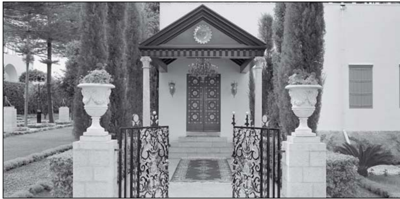
Entrance to the Shrine of Baha'u'llah, burial place of the founder of the Bahá'í faith, near Acre, Israel.

The government released Baha'u'llah in 1853, and exiled him to Baghdad, then part of the Ottoman Empire. It was during this exile that he publicly announced the establishment of the Baha'i faith. Indeed Baha'u'llah claimed to be the manifestation