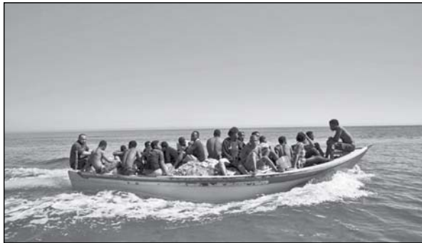
The Libyan coastguard has received money from the EU to stop migrant boats crossing the Mediterranean.

These words, from a young Malian man, were mirrored by many others who spoke of being held captive, put