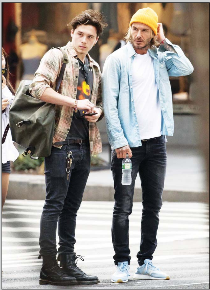
COLLEGE BOUND: Brooklyn Beckham took dad David Beckham to his college orientation at Parsons School of Design in New York City recently.