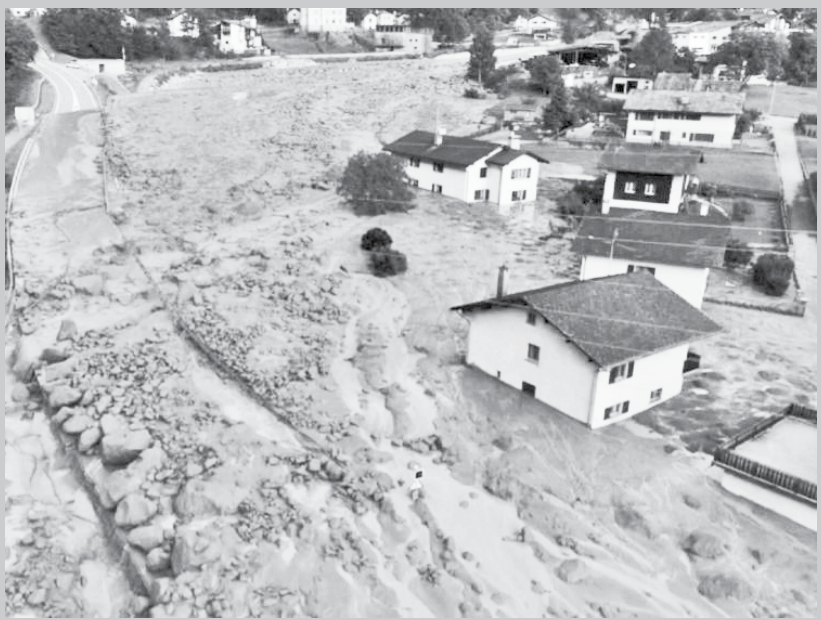
Eight people are missing following a landslide in southeastern Switzerland, police have said. Around 100 people have been evacuated from several small villages in the Val Bondasca region following the landslide on Wednesday. Graubunden cantonal police have said that German, Austrian and Swiss citizens are among the missing.

The researchers also note a scarcity of alcohol treatment programmes in the Puducherry and Tamil Nadu region and that heavy alcohol use has an impact on TB treatment outcomes.