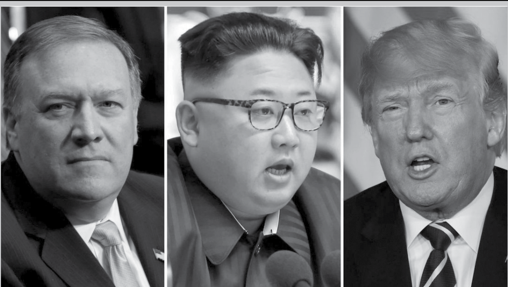
Donald Trump’s nominee for secretary of state- CIA boss Mike Pompeo - travelled to North Korea to meet Kim Jong Un, US officials have confirmed. Mr Pompeo made the secret visit to Pyongyang during the first weekend in April, according to the Washington Post. Speaking on condition of anonymity, the two officials said the trip was to prepare for an upcoming meeting between Mr Trump and the country’s leader. Mr Trump is due to meet Mr Kim this month, with five locations being considered for the talks, he said.

BEIJING, APR18 (AFP): China held live-fire drills in the Taiwan Strait today but Taipei dismissed the exercises as “routine” after expected large-scale naval manoeuvres failed to materialise. Beijing had announced the drills last week, further ramping up tensions following stark warnings against any independence moves by the self-ruled island which China sees as its sovereign territory. Vessels had been told to avoid a certain area off the Chinese mainland’s coast, triggering speculation that a flotilla spearheaded by China’s sole aircraft carrier would take part in the exercise.