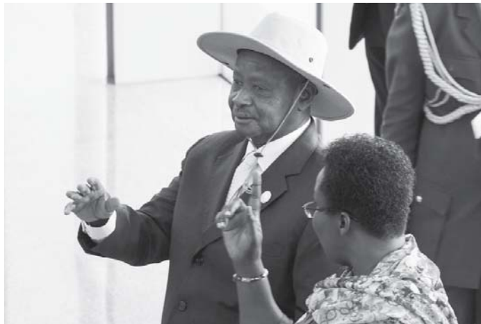
President of Uganda Yoweri Museveni refuses to relinquish power.

The rhetoric pointed in the right direction. But not all African leaders were willing to be swept by this wave of democratic reforms. Some are quite simply addicted to power,