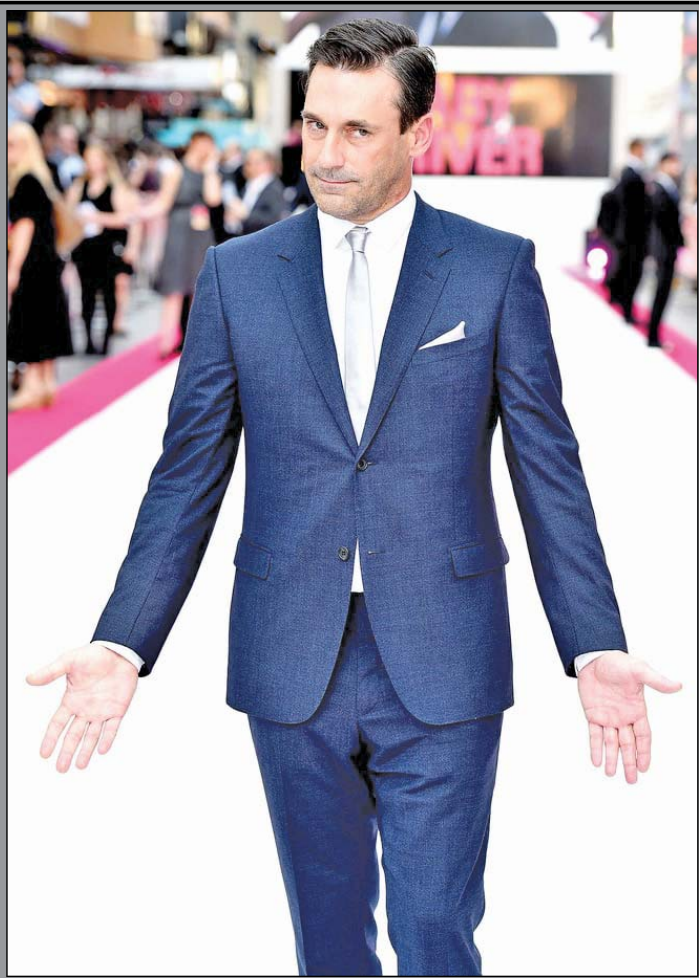
HAMMING IT UP: Jon Hamm struck a pose as he attended the Baby Driver premiere in London recently.