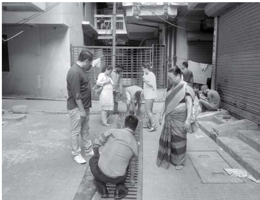
using buckets and cartons in place of commercial dustbins provided by the Municipal Office. The owners have been directed to visit the Municipal Office in Singtam on 04 Jun to collect proper dustbins.

Many hotels, tea shops and lottery shops at Ward No. 03 had been