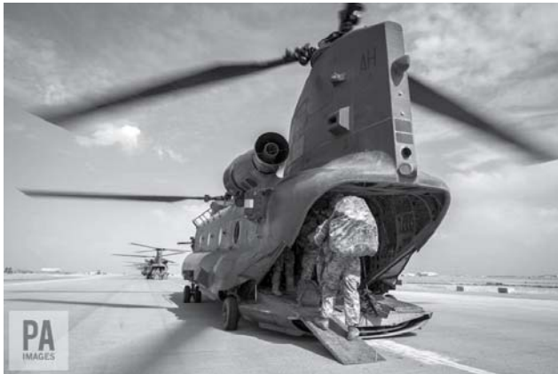
The last British troops leave Camp Bastion in Helmand province, Afghanistan in October 2014.

[the writer is Research Fellow in Citizenship & Governance, The Open University]