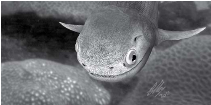
An artist's reconstruction of the ancient fish Ligulalepis .

The pattern of bones that form the skull roof was an unexpectedly primitive feature also seen in an extinct group of jawed fishes called placoderms.