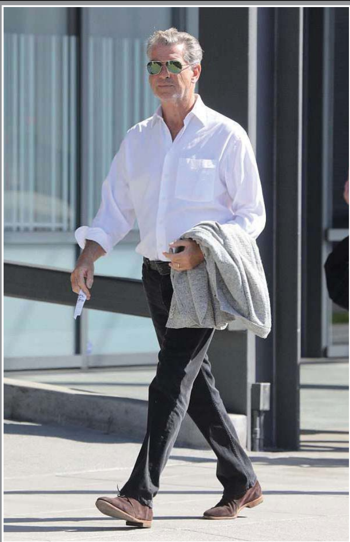
SUAVE! Pierce Brosnan, 64, maintained his trademark dapper looks as he sported a sharp white shirt, which was teamed with a pair of grey trousers and smart brown brogues.