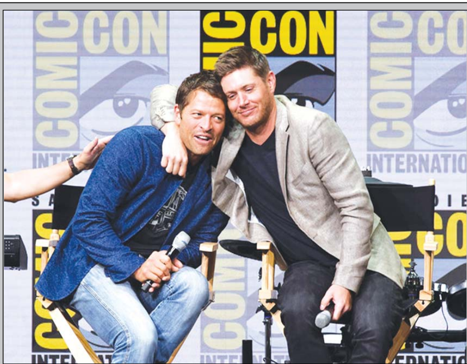
BROMANCE! Actors Misha Collins (L) and Jensen Ackles at the "Supernatural" panel during Comic-Con International 2017 at San Diego Convention Center in San Diego, California.

But despite the long distance, the brunette beauty still had a total blast on her special day! She celebrated with some of her closest non-famous friends in the comfort of her own kitchen, where she was showered with gifts, balloons, and a delicious birthday cake with candles. As Selena made her birthday wish, her BFFs took pictures and recorded videos that she's just dying to show The Weeknd over dinner!