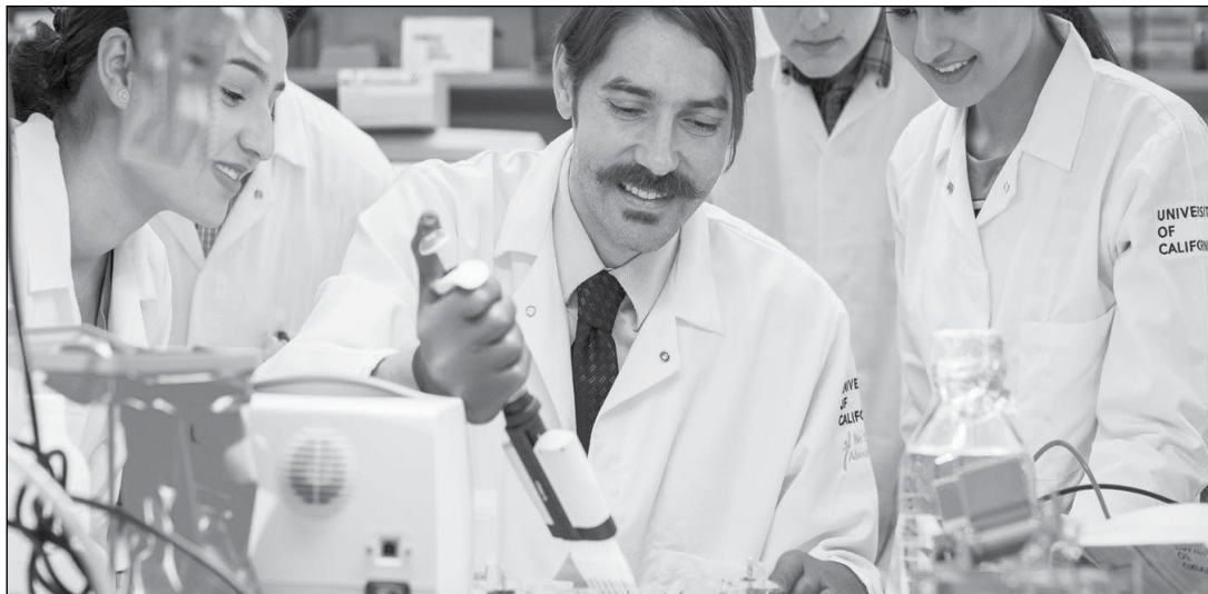
Professor Fabian V. Filipp with his team working on precision targeting of malignant melanoma.

A HIDDEN LAYER OF REGULATION It is well established that cancer is a disease of our genes. However, resistance to therapy might go beyond cancer mutations that usually alter the function of genes. It may not be new mutations that are causing resistance to drugs. The DNA can stay the same, but cancer cells adapt