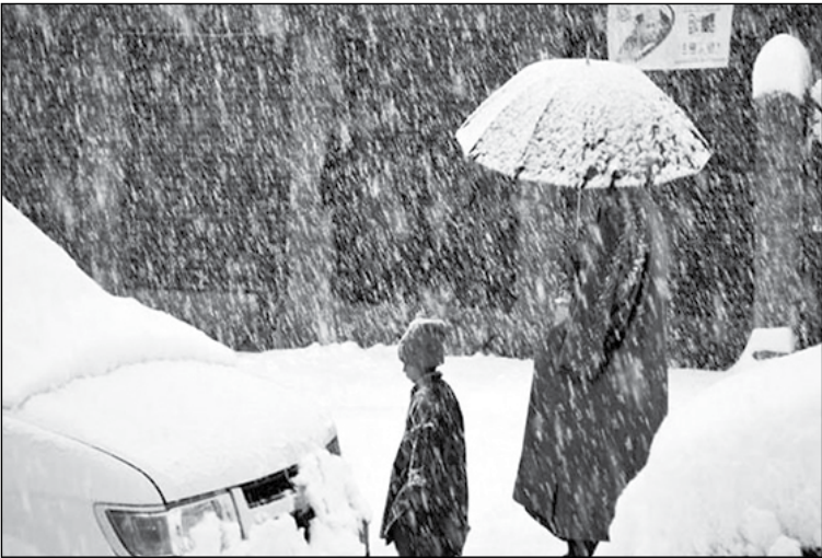
According to him, Leh town was the coldest in the state with the mercury there settling at minus 6.9 degrees Celsius. Night temperatures at all other places in Kashmir division stayed above the freezing point last night.

SRINAGAR, Nov 17 (PTI): The famous ski-resort of Gulmarg in north Kashmir along with Leh and Kargil towns in Ladakh region recorded the season’s coldest night owing to snowfall in several areas in the upper reaches of Jammu and Kashmir earlier this week. Gulmarg recorded a low of minus 5.6 degrees Celsius, a Meteorological Department official said here. The area experienced a drop of over five degrees in night temperature from the previous night’s zero degree Celsius, he said. Gulmarg was the coldest place in the Valley and the second coldest in Jammu and Kashmir along with Kargil, the official said. Kargil town in Ladakh region also registered minimum temperature of minus 5.6 degrees Celsius, the official said.