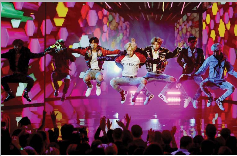
MAKING HISTORY! K-Pop Superstars BTS made history on Sunday night as the first Korean pop group to perform at the American Music Awards 2017.