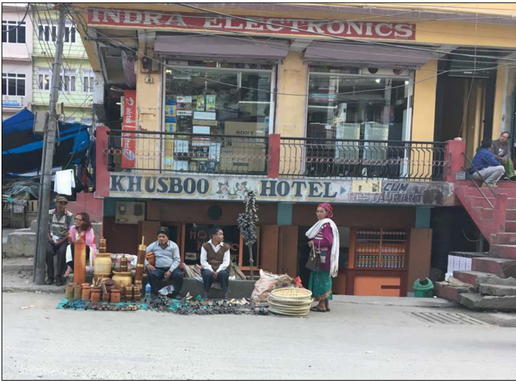
Traditional kitchen and farm tools on sale at Singtam bazaar on a Sunday. The stalls did not seem to draw a lot of customers, perhaps the lure of gleaming factory-made wares have become a bit too much for us to resist.