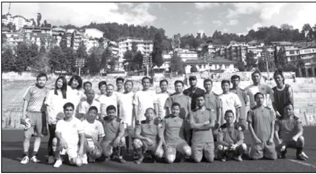
adjudged as Man of the Match for his hattrick during the match.

This friendly match was part of the ongoing 6th Sikkim Inter-Church Football Tournament 2017 here at Paljor Stadium which is being organized by SCSC.