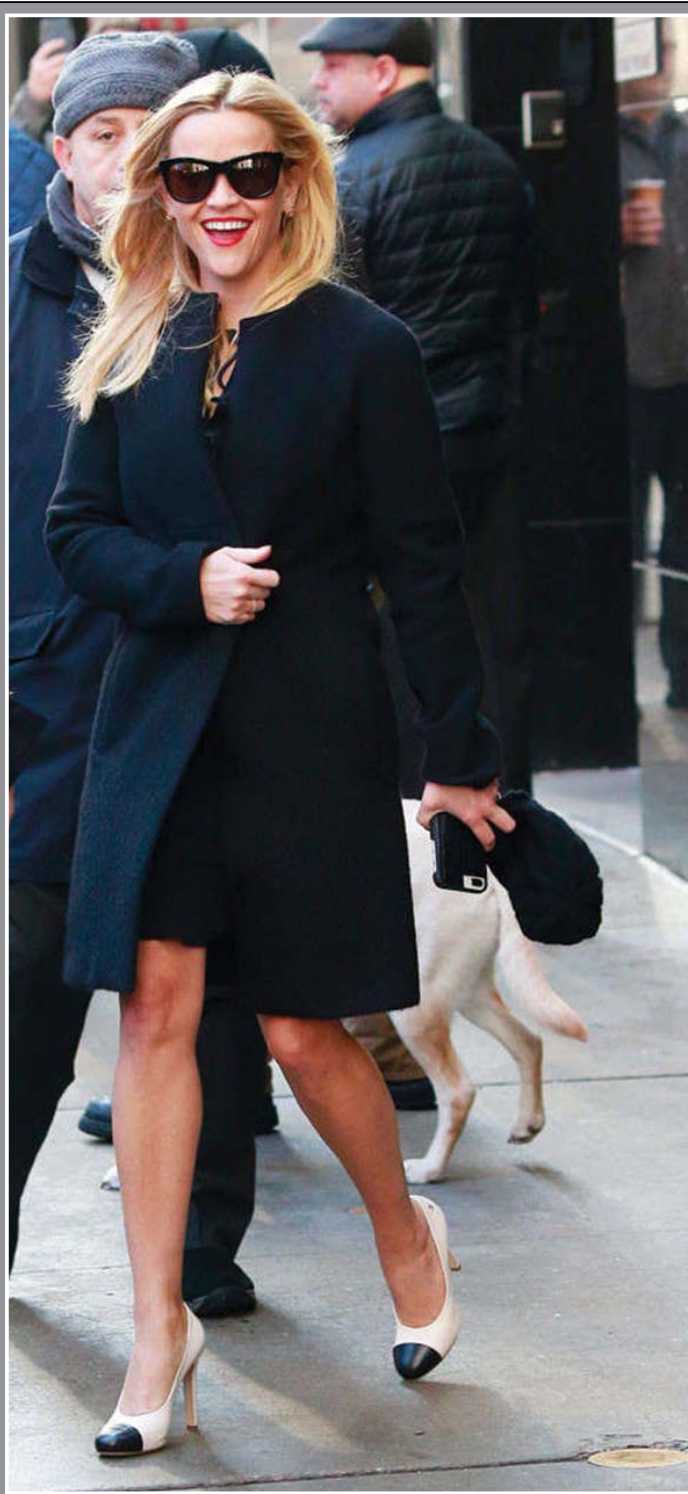
CITY SMILES! Reese Witherspoon looks radiant at Good Morning America in The Big Apple.

to book advertisements, mail us at advertise@sum- mittimes.com or call 9933427505, 9734152451 8670631291 03592-208698