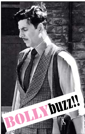
intense pose for the camera.

The national award-winning actor who has taken off to London captioned the monochrome first look as, "Set out on a brand new journey, aiming for nothing less than #GOLD! Day 1 of Gold, need your love and best wishes as always :)." In the photograph shared, a waistcoat-clad Akshay can be seen sporting a mustache, carrying a sling bag and striking an