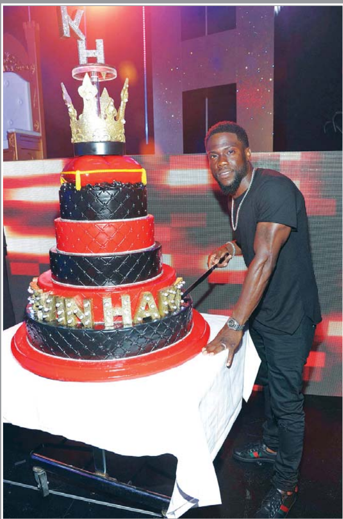
FIT FOR A KING: Kevin Hart celebrated his 38th birthday in style at Foxwoods Resort Casino in Mashantucket, Connecticut recently.