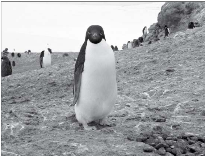
Adélie penguin at the Mt Siple breeding colony, West Antarctica

Antarctica's ice-free areas are currently limited to a scattering of rocky outcrops along the coastline, or cliff faces, or