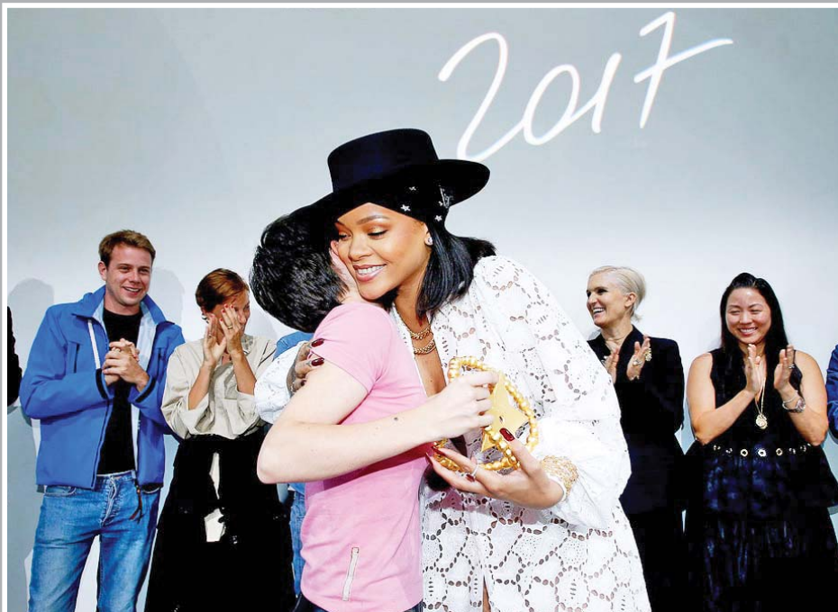
WHAT A PRIZE: Rihanna hugged the winner of the Young Fashion Designer LVMH Prize 2017 in Paris recently.

1978: The Karakoram Highway opened today. The 1,300 km highway is named "Karakoram" as it passes through the Karakoram mountain range.