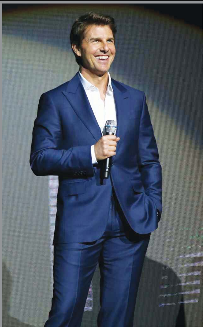
ACTOR TOM CRUISE GIVES A TALK ONSTAGE DURING CINEMACon IN LAS VEGAS.