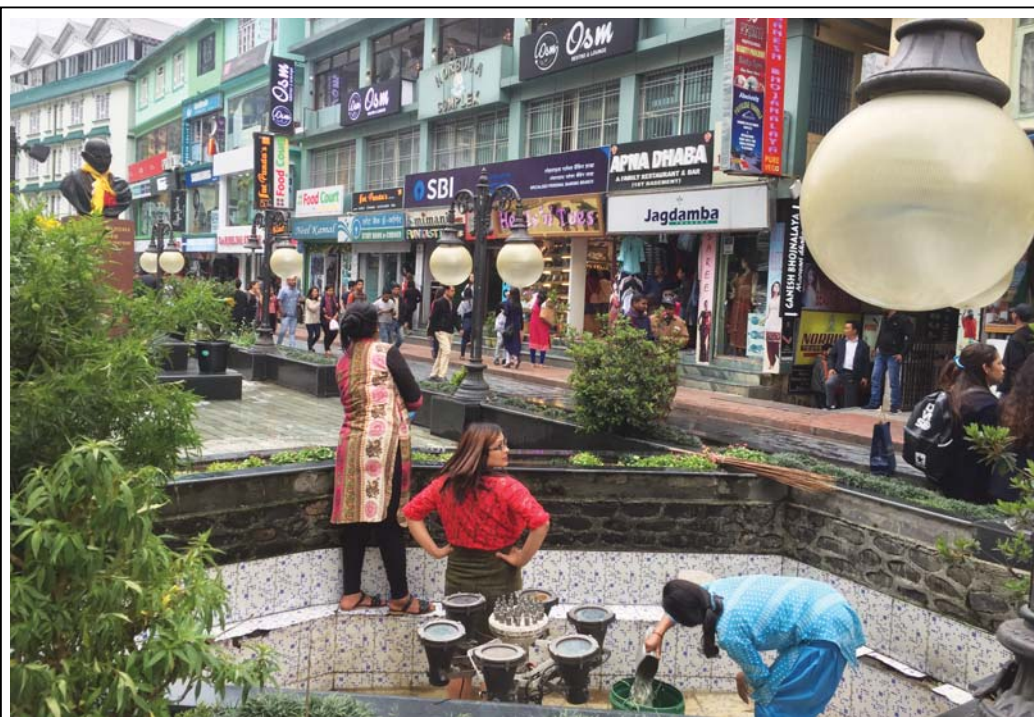
LIVING CLEAN LIKE BAPU WOULD HAVE WANTED: While shoppers and tourist throng the busy pedestrian mall of MG Marg, workers clean the most frequently visited Gandhi spot in the capital.