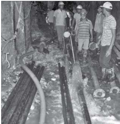
THE DAY AFTER: The mouth of the Adit-III tunnel (right) which was inundated by a wall of water carried by a flash flood in the Rangpo Khola fatally trapping 10 labourers at work about a kilometre deeper on the night of 16 April 2009. And above, coworkers of the drowned labourers monitoring the water pump so that they can retrieve the dead bodies.