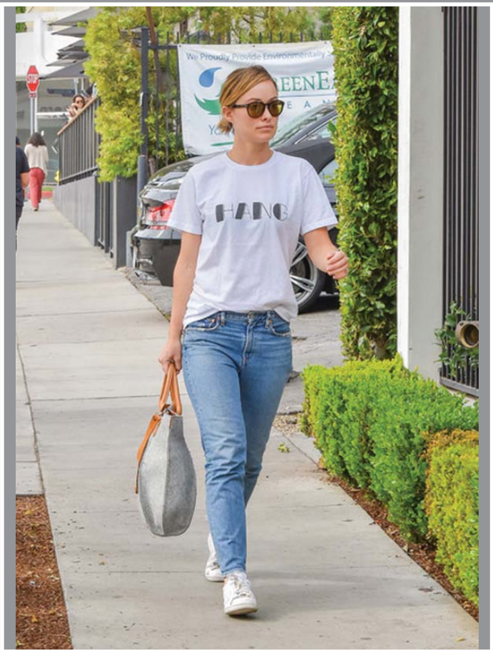
OUT & ABOUT! 33-year-old actress, Olivia Wilde, donned a white T-shirt with the word 'hang' emblazoned across the front in bold black lettering to enjoy a vegan lunch at Gracias Madre.