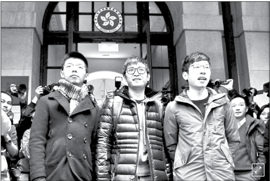
Hong Kong's highest court freed three young leaders of the city's pro-democracy movement on Tuesday, including the public face of the protests, Joshua Wong, in a stark reversal of an earlier ruling, but it warned against future acts of dissent. The unanimous decision was made by a panel of five judges on the Chinese-ruled city's Court of Final Appeal. Wong, 21, Nathan Law and Alex Chow had served roughly two months in jail before they were granted bail in November. The five judges, including a non-permanent foreign judge, Lord Leonard Hoffmann, said in the judgment that they had "quashed the sentences of imprisonment" by the Court of Appeal. They stressed, however, that Hong Kong was a law-abiding society and that "future offenders involved in large-scale unlawful assemblies involving violence" will be subject to stricter guidelines laid down by the Court of Appeal.

After Benazir, it was PPP's previous government (2008-13) that had taken up the Kashmir issue with the then Indian prime minister Manmohan Singh. Zardari said Musharraf's (India friendly) plan on the Kashmir issue was rejected by other generals.