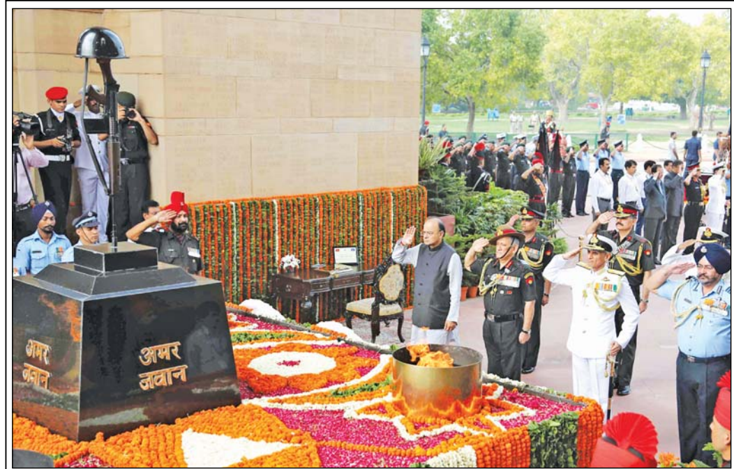
JAI JAWAN: Union Minister for Finance, Corporate Affairs and Defence, Arun Jaitley, along with the Chief of Army Staff, General Bipin Rawat, the Chief of the Air Staff, Air Chief Marshal BS Dhanoa and the Vice Chief of the Naval Staff, Vice Admiral Karambir Singh paying homage to the martyrs at Amar Jawan Jyoti, India Gate, on the occasion of Kargil Vijay Diwas, in New Delhi on July 26, 2017.