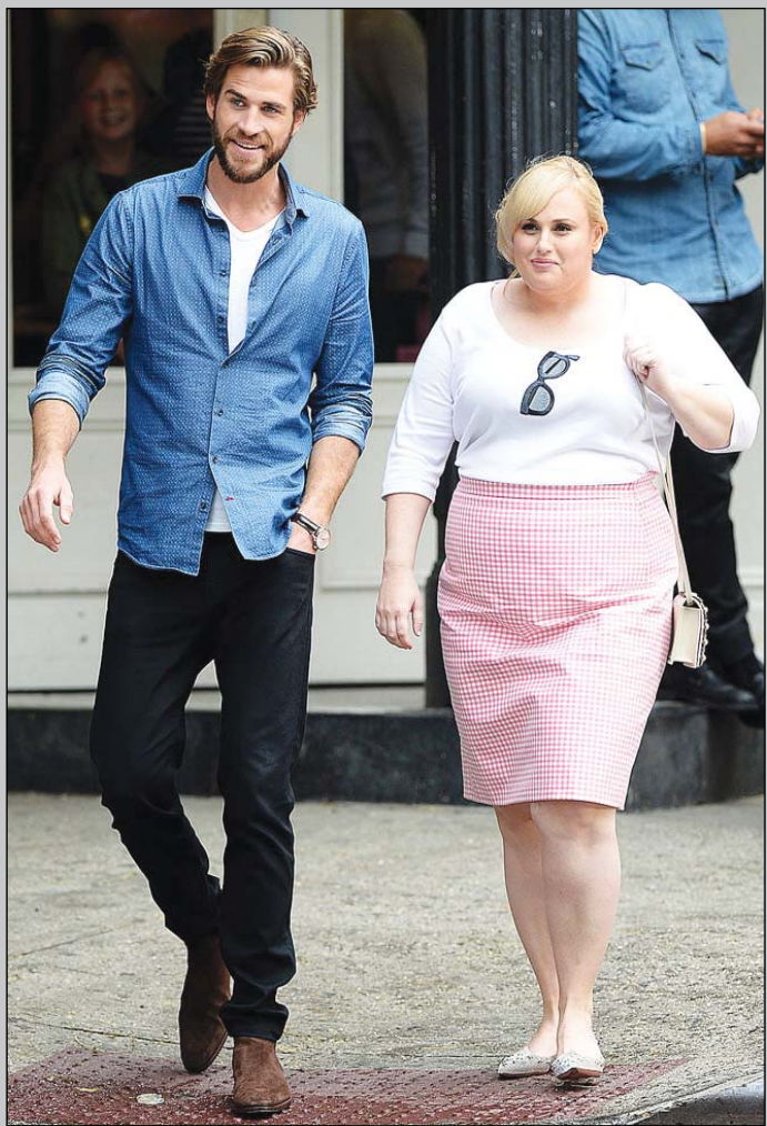
REBEL COSTARS: Liam Hemsworth and Rebel Wilson were spotted on the set of Isn't It Romantic in NYC. The movie also stars Priyanka Chopra and Adam DeVine