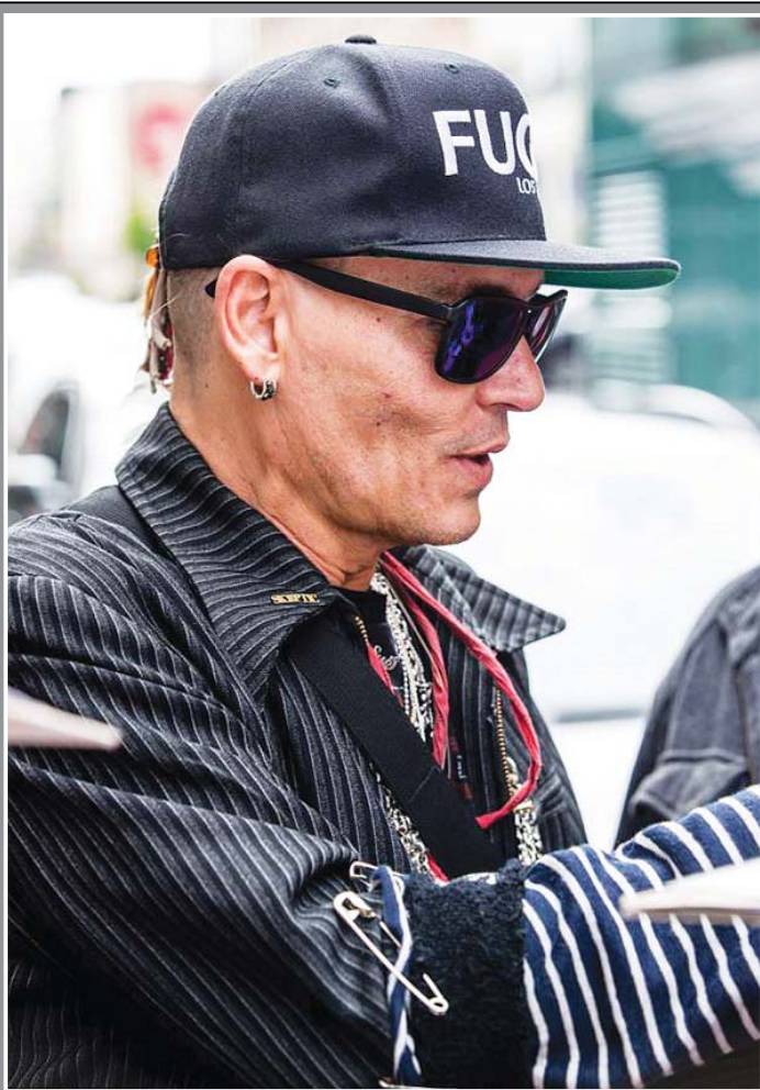
THAT YOU JOHNNY? Johnny Depp, 54, greeted fans outside his Berlin hotel on Sunday afternoon after prompting concern over his notably gaunt appearance.