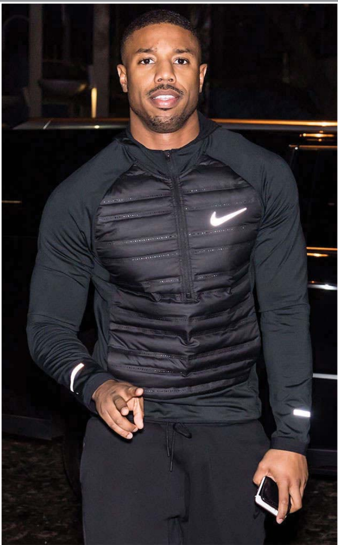
PEACE OUT! Black Panther actor Michael B. Jordan arrives at a restaurant for a Creed II cast dinner in Philadelphia, Penn.

written by Elton John and Bernie Taupin, including Miranda Lambert, Alessia Cara, Miley Cyrus, Lady Gaga, John Legend, Kesha, Little Big Town, Chris Martin, Shawn Mendes, Maren Morris, Ed Sheeran, Sam Smith and SZA.