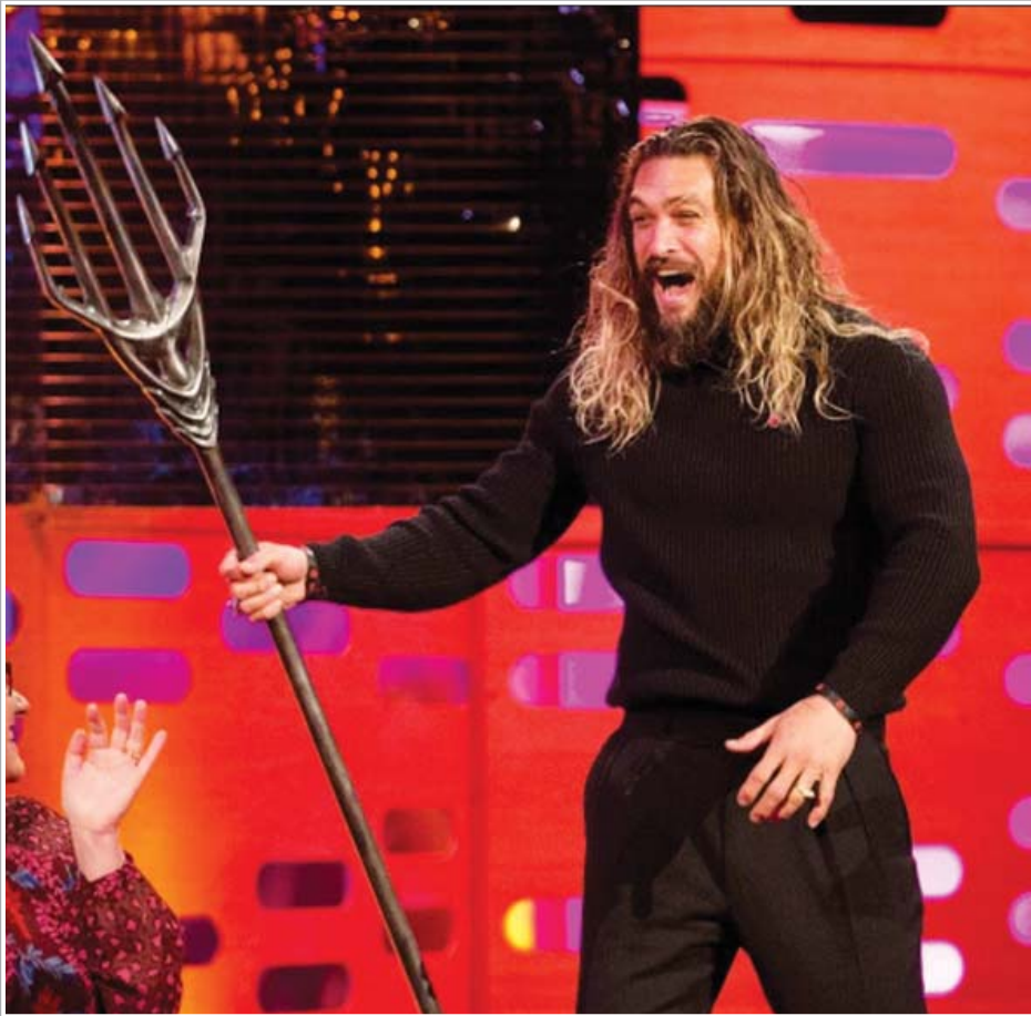
DROGO, THE AQUAMAN: Jason Momoa, who plays Aquaman in the upcoming 'Justice League' film, shows off his trident while filming 'The Graham Norton Show' in London.