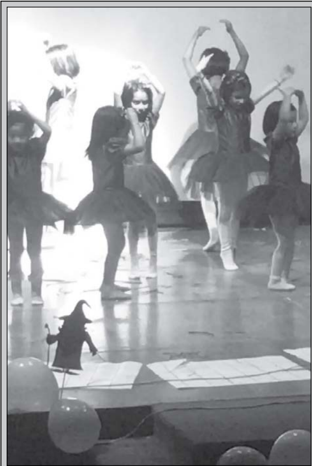
Toddlers of Jack & Jill Kids, a kindergarten school in Gangtok, treat parents to an annual day programme here at Manan Bhavan on Friday, 10 November. Children from the playgroup, Nursery, LKG and Grade-1 were in performance for indulgent parents and grandparents today. The school is located at Lower Arithang, Gangtok.