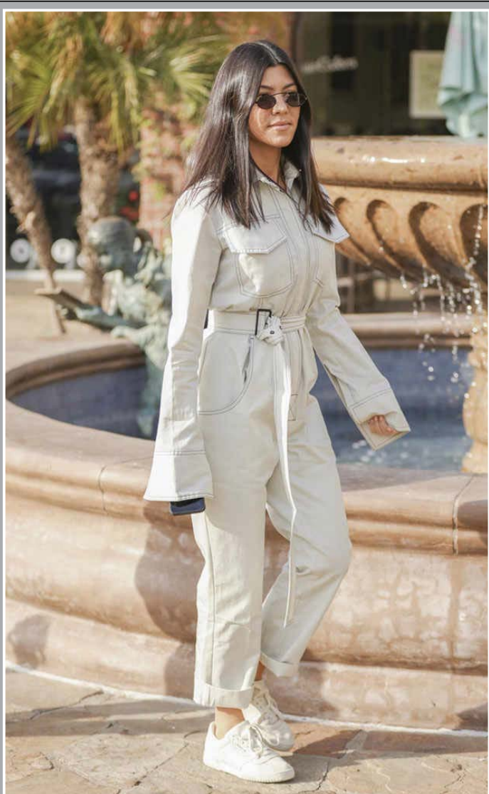
INCOGNITO! The mother of three, Kourtney Kardashian, is out and about in LA the day after Christmas.