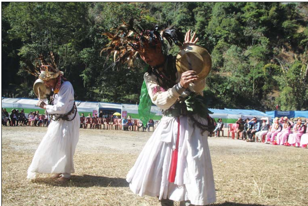
PHEDANGMAS FOR NAMSOONG! Two Phedangmas, Limboo priests, were invited to be part of day-02 of the State Level Tribal Festival/ Namsong celebrations underway at Namprikdang in Dzongu, North Sikkim. People in attendance got the rare opportunity to watch the duo perform rituals and get a peek into the frenzied energy with which they spin away bad luck and ward off the evil eye.