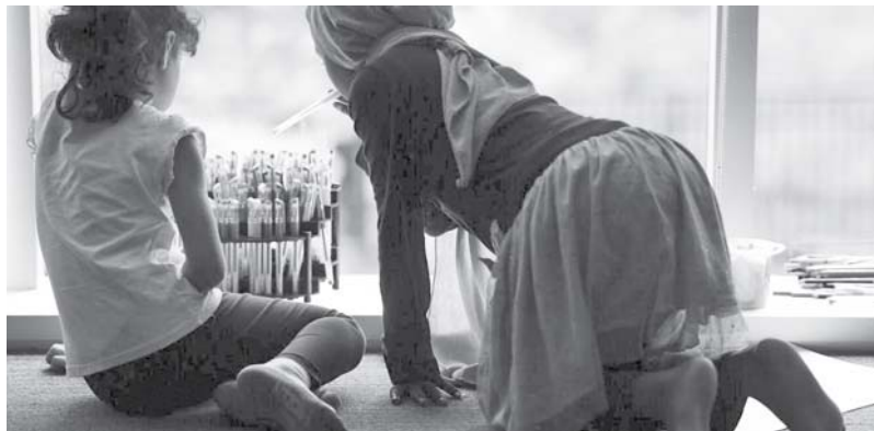
Two refugee children play at Tolan Park, a research and treatment center in Detroit, the site of the author's research.

WHAT IS POST-TRAUMATIC STRESS DISORDER? Post traumatic stress disorder, or PTSD, is a consequence of exposure to extreme traumatic experiences such as combat, torture, assault, rape, robbery or serious motor vehicle accidents. Such experiences switch the brain to "survival mode," attempting to avoid re-traumatization. Symptoms include high anxiety, avoiding reminders of trauma (sights, sounds, smells, memories), emotional numbness, hyper-vigilance, frequent intrusive