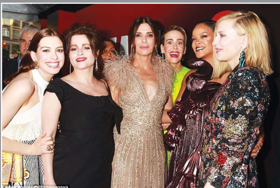
THE GANG! Away from the formality of the red carpet, the cast of Ocean's 8 showed their personalities at the world premiere of the all-female reboot in New York.