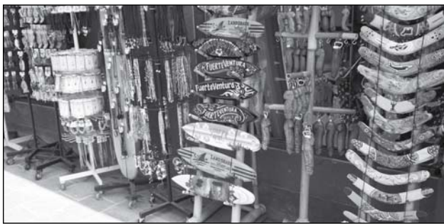
A souvenir stand in the Canary Islands displaying boomerangs (on the right).

This appropriation shows a serious lack of understanding and respect of protocols. The need to find/discover one's self via the culture and heritage of a different people is nonsensical to me. Here are some other areas of irritation and appropriation that would make us cry if we didn't have such