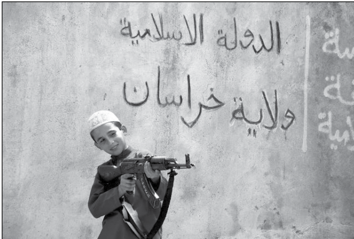
An unidentified child of a militant of Islamic State (IS) plays with an AK-47.

Further, children born of sexual violence in conflict, which includes children of IS, exist in what the the Secretary-General on Sexual Violence in Conflict has previously termed an "accountability gap". While children born of sexual violence have been recognised as victims eligible for reparations as a result of truth commis-