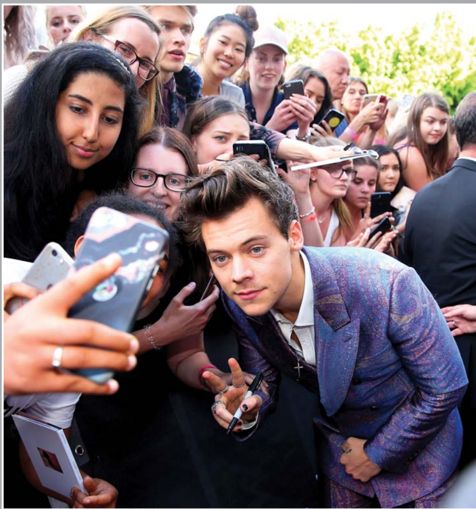
SWEET CREATURE: Harry Styles posed with fans ahead of the 31st Annual ARIA Awards in Sydney, Australia.