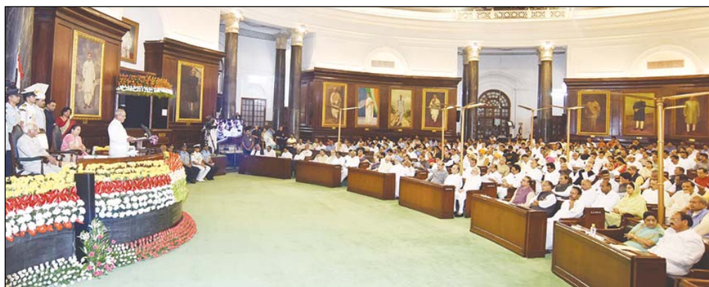
President Pranab Mukherjee speaking at his farewell ceremony at Central Hall of the Parliament in New Delhi on July 23, 2017.

The hour-long function was attended by Vice President Hamid Ansari, Prime Minister Narendra Modi, former prime ministers Manmohan Singh and H D Deve Gowda, Lok Sabha Speaker Sumitra Mahajan, Congress chief Sonia Gandhi, Congress vice president Rahul Gandhi, Union min-