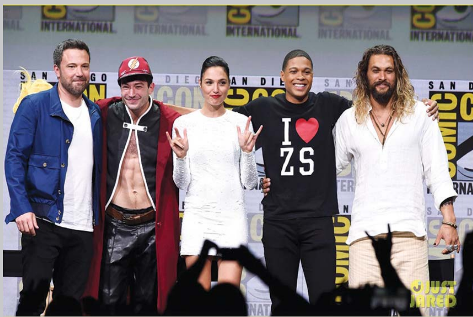
HEROES GATHER: Justice League actors Gal Gadot (Wonder Woman), Jason Momoa (Aquaman), Ben Affleck (Batman), Ezra Miller (Flash) and Ray Fisher (Cyborg) at 2017 Comic-Con in San Diego, California.