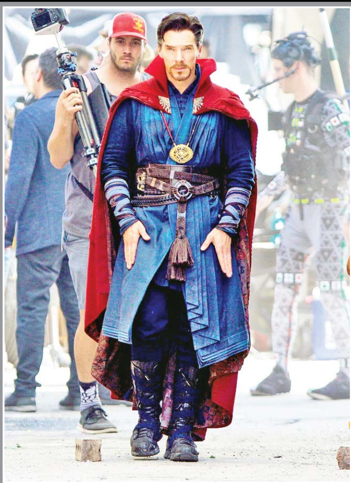
DOCTOR STRANGE REPORTING IN: Benedict Cumberbatch, in costume as Doctor Strange, prepared to film 'Avengers: Infinity War' on location in Atlanta.