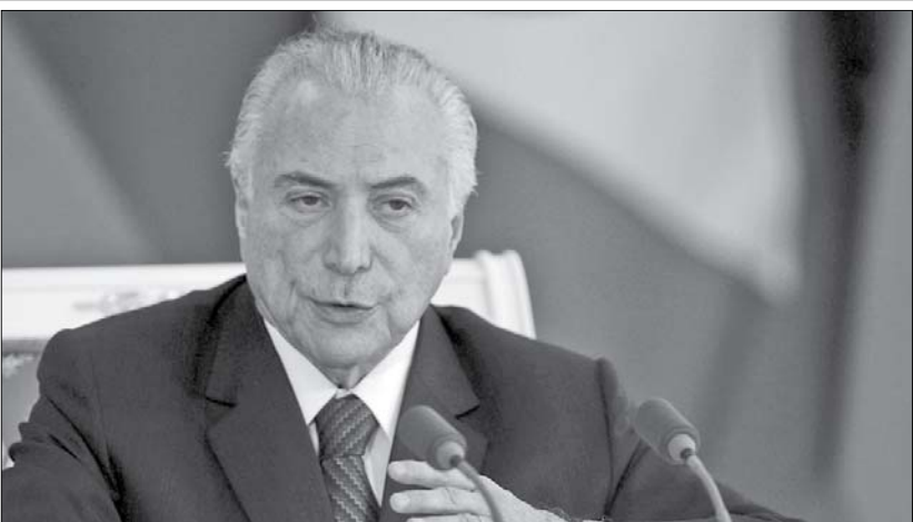
Brazilian President Michel Temer has been charged with accepting millions of pounds worth of bribes. Prosecutors claim Mr Temer “fooled Brazilian citizens” by receiving money from a meat packing firm in exchange for resolving tax matters and freeing up loans from state-run banks. A Supreme Court judge will decide whether to send the charges to the lower house of parliament, which can approve a trial with a two-thirds majority vote. Supporters of Mr Temer say they have between 250 and 300 votes in the 513 seat parliament - enough to block a trial.

While Trump has 32.8 million followers on Twitter, Modi comes a close second with over 31 million followers. On Facebook, Modi has the lead over Trump, who has 23.6 million followers while the Indian leader has 41.8 million followers.