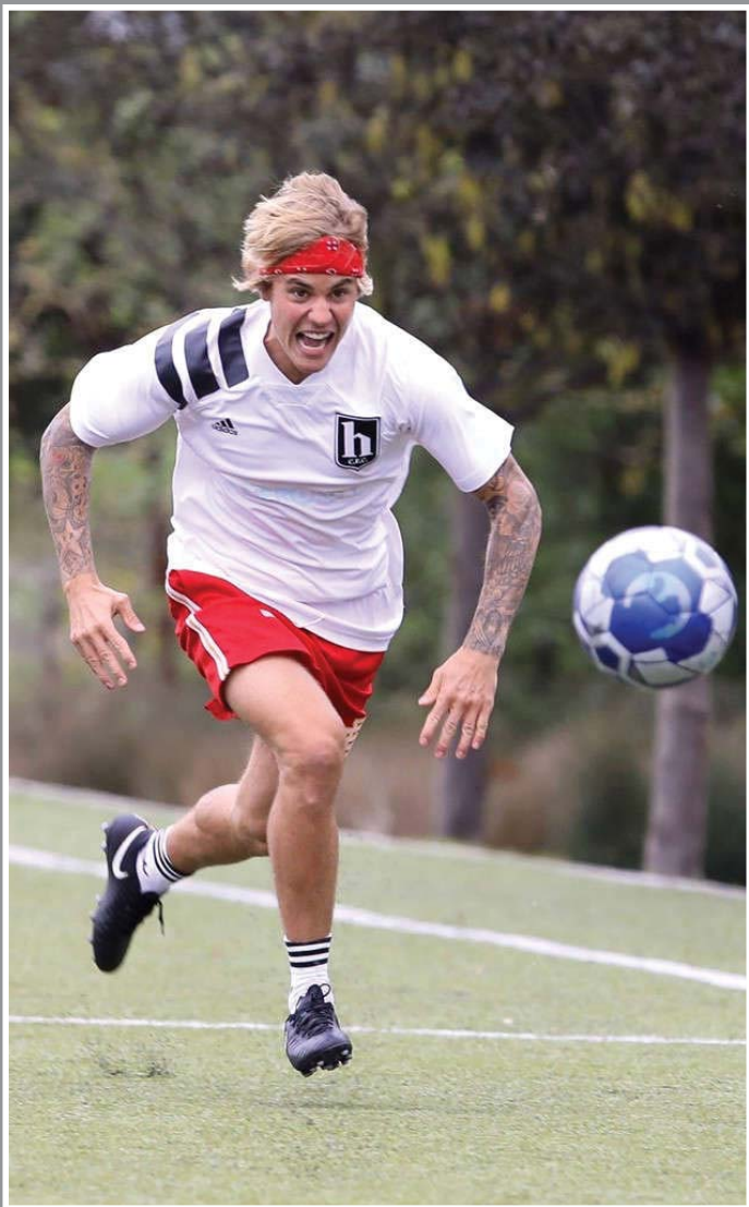
GAME FACE! Pop sensation Justin Bieber keeps his eye on the ball while playing soccer with his friends in Playa Vista, Calif.