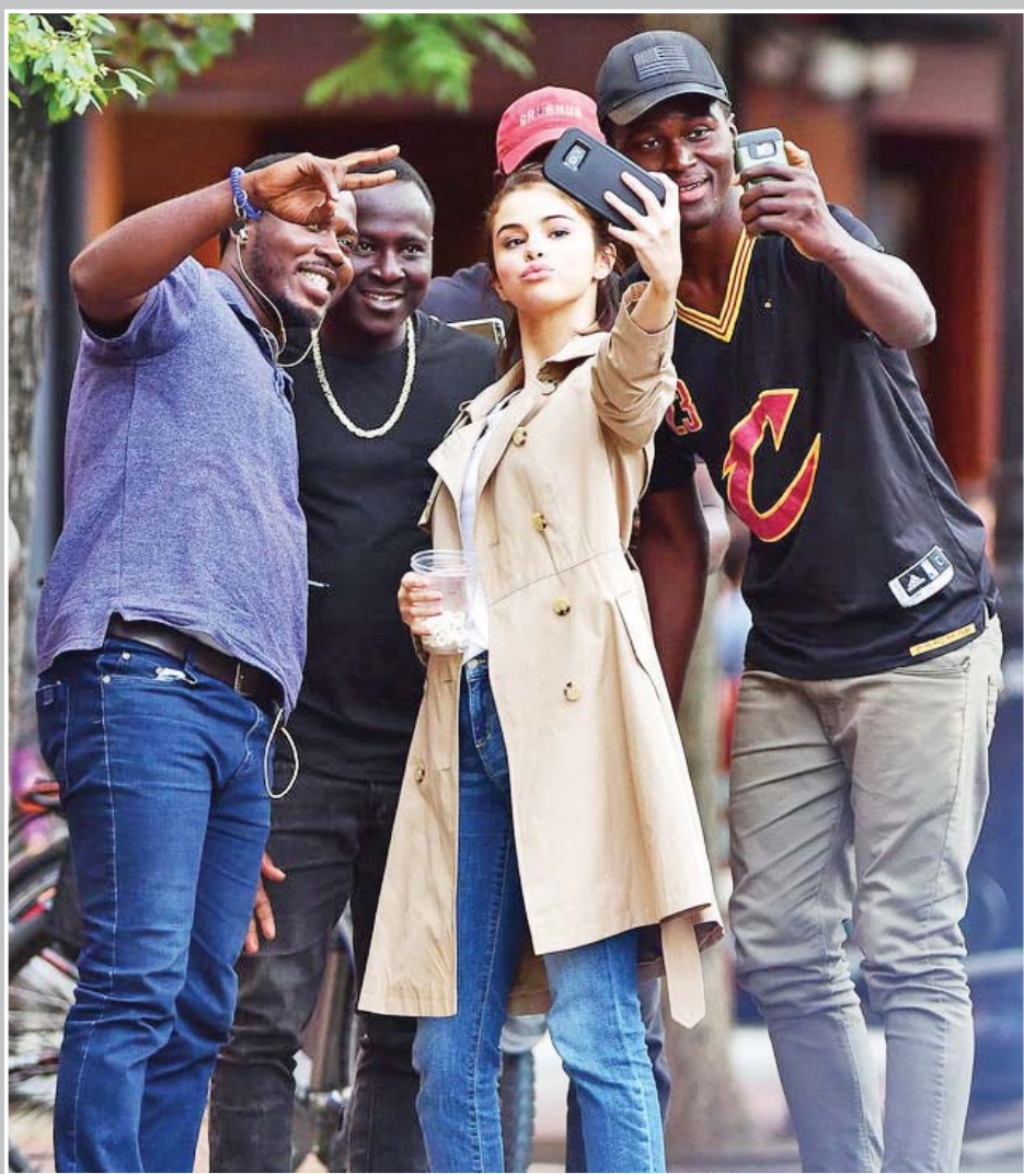
FAN-FRIENDLY: Selena Gomez stopped to greet some fans while shooting her new Woody Allen film in NYC's Greenwich Village.