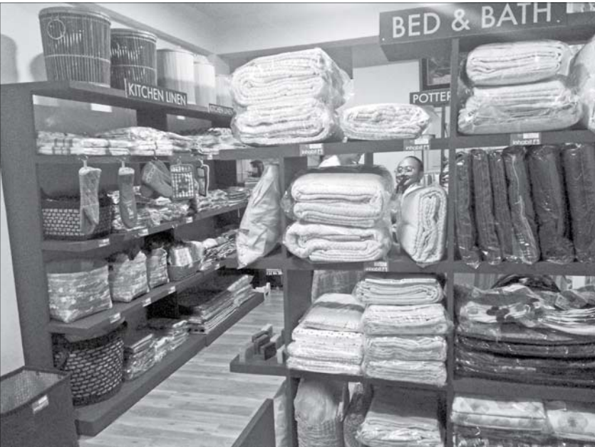
"We should promote our local products which are environment friendly rather than endorsing Chinese products which are not even reliable," she further adds.

"Why promote Chinese products when we are living in India," she says.