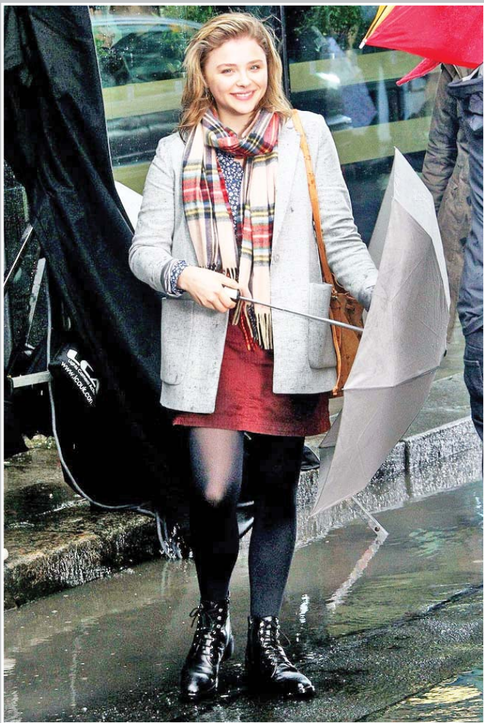
RAINY DAY SMILES: Chloe Grace Moretz flashed her smile while filming a rainy scene for 'The Movie' in Dublin.